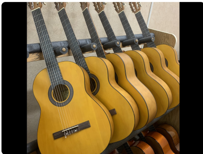
Arts Materials and Supplies